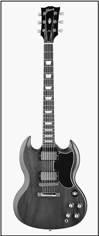
Gibson SG '61 Reissue