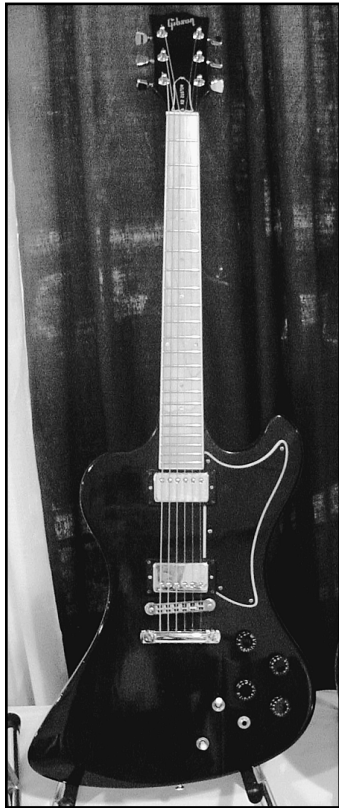
1977 Gibson RD Custom