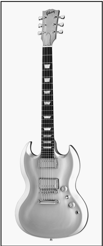
Gibson SG Diablo