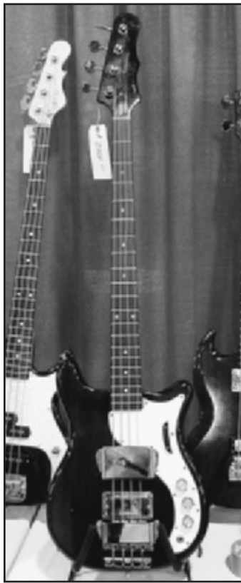
'67 Epiphone Embassy