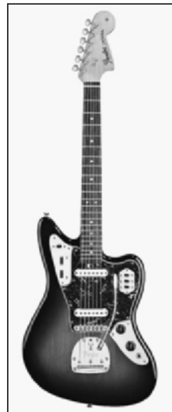
Fender Jaguar Classic Player Special