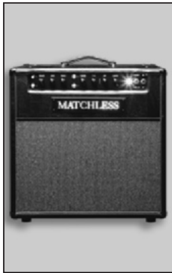
Matchless SC-30 Standard