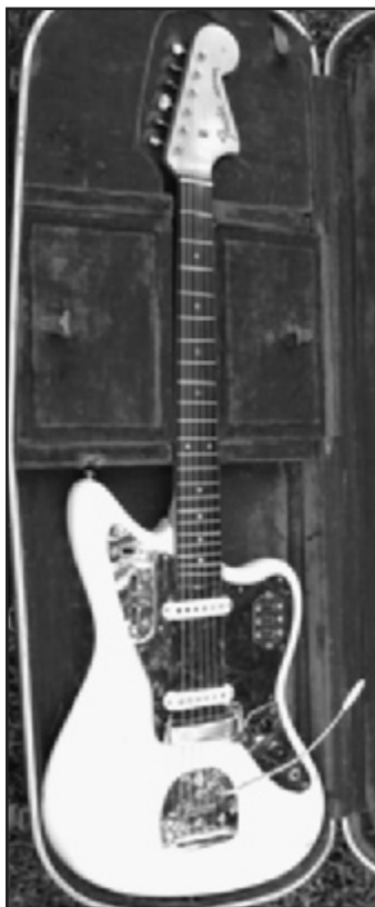
'63 Fender Jaguar