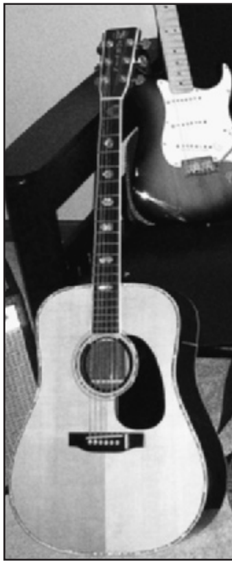
'73 Martin D-41