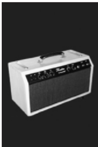
Maven Peal Naked Zeeta 1->50