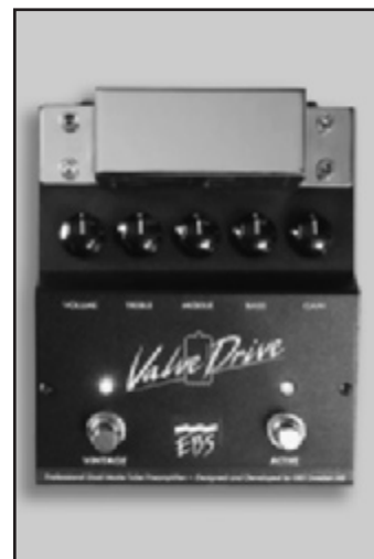
EBS Valve Drive