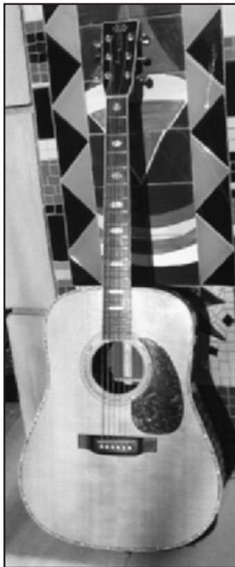
2003 Martin D-41