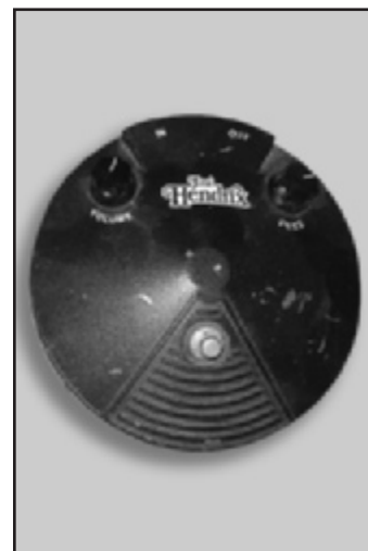
Dunlop Jimi Hendrix Fuzz JH-2