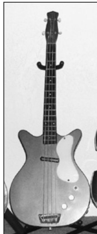
1960 Danelectro Model 3412 Shorthorn Bass