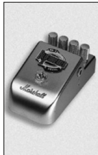
Marshall Blues Breaker II Overdrive