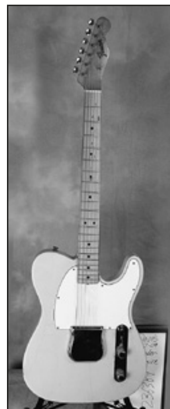
1957 Fender Esquire