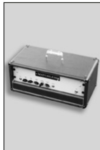
Matchless Reverb RV-1