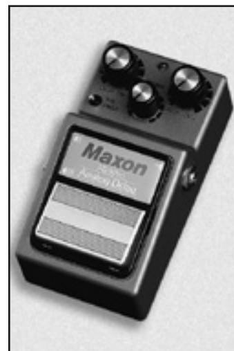
Maxon AD9 Pro