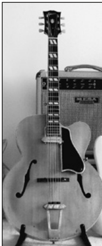
1952 Gibson L-7