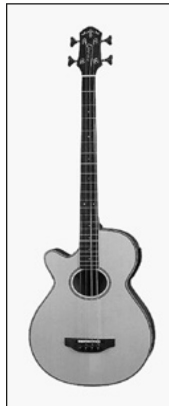
Crafter USA BA400EQL