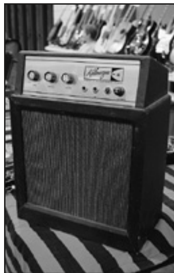
Kalamazoo Model 4