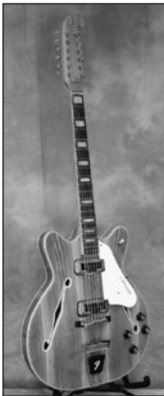
1968 Fender Coronado XII